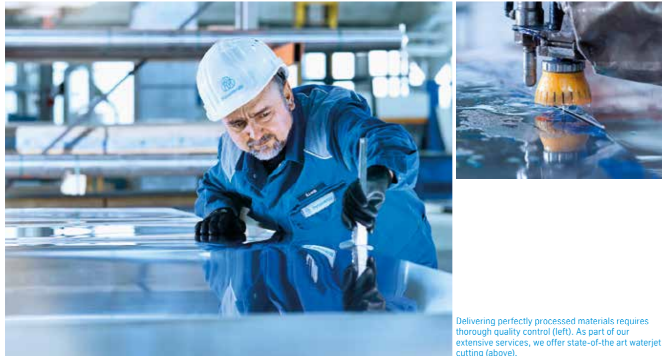
Delivering perfectly processed materials requires thorough quality control (left). As part of our extensive services, we offer state-of-the-art waterjet cutting (above).

“Delivering reliable and high-quality products, services and solutions with precision and a superior cost-benefit ratio.”