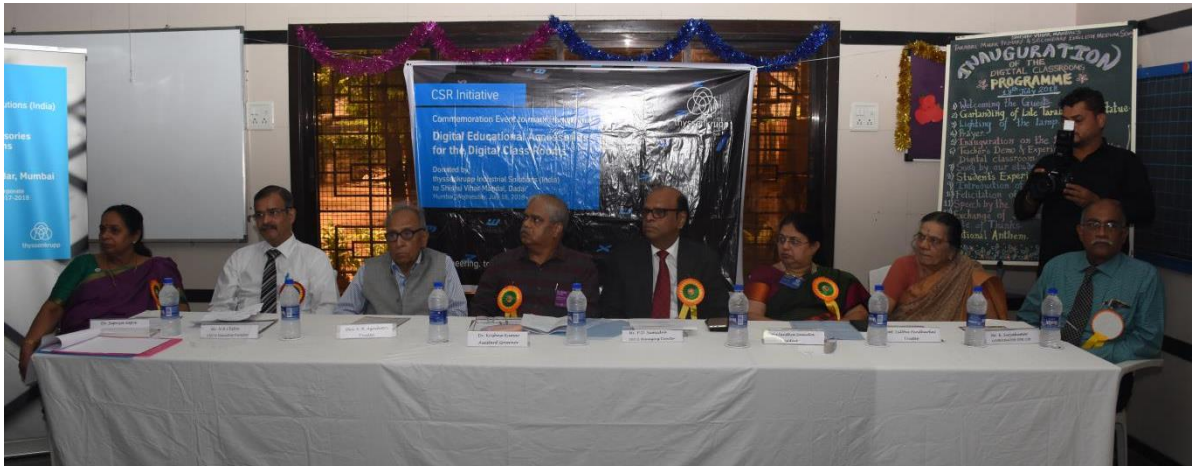
Dignitaries from the Shishu Vihar School tkIS India and the Rotary Club of Mumbai Mahim...