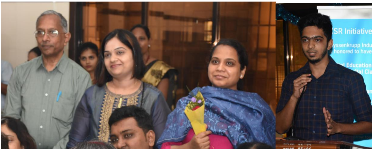
tkIS India team members who worked on the Shishu Vihar School project...